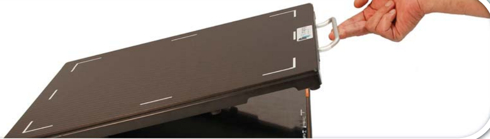
Easy Lift Handle

This product is perfect for bariatric, equine, and podiatry procedures.