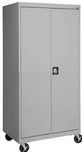
Locker in Gray